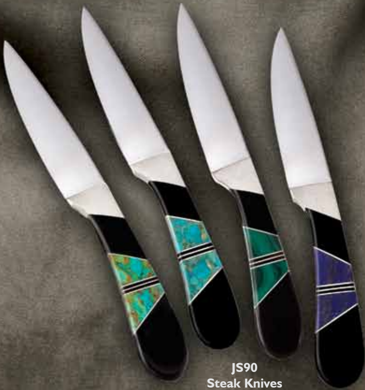
JS90 Steak Knives set of four