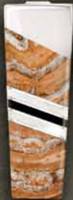
MAM51 Money Clip