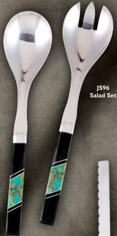
JS96 Salad Set