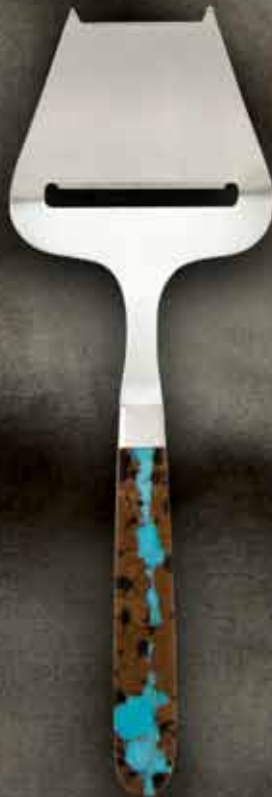
VT98 Cheese Slicer