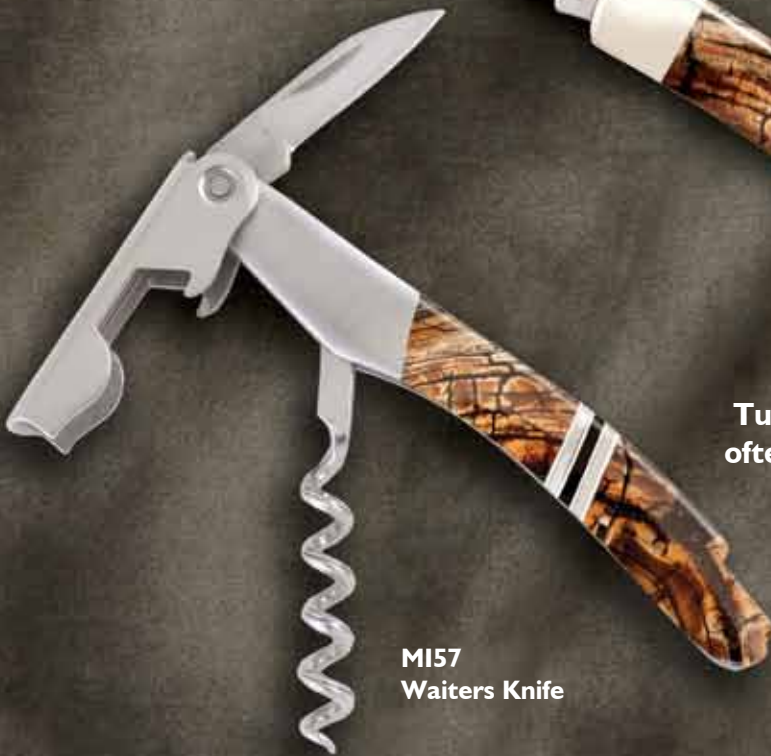
MI57 Waiters Knife

The material in these knife handles is Woolly Mammoth Tusk- the undersides of Woolly Mammoth Tusks often show wear, suggesting that they were used in scraping snow and ice off the ground cover of vegetation during feeding. They also used their tusks for protection from predators, attraction during mating and as a display of dominance to other Woolly Mammoths. We proudly show our respect by using this material in our best knives.