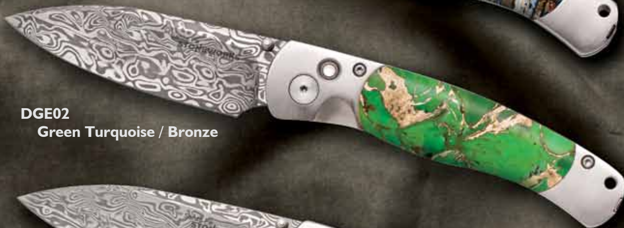
DGE02 Green Turquoise / Bronze