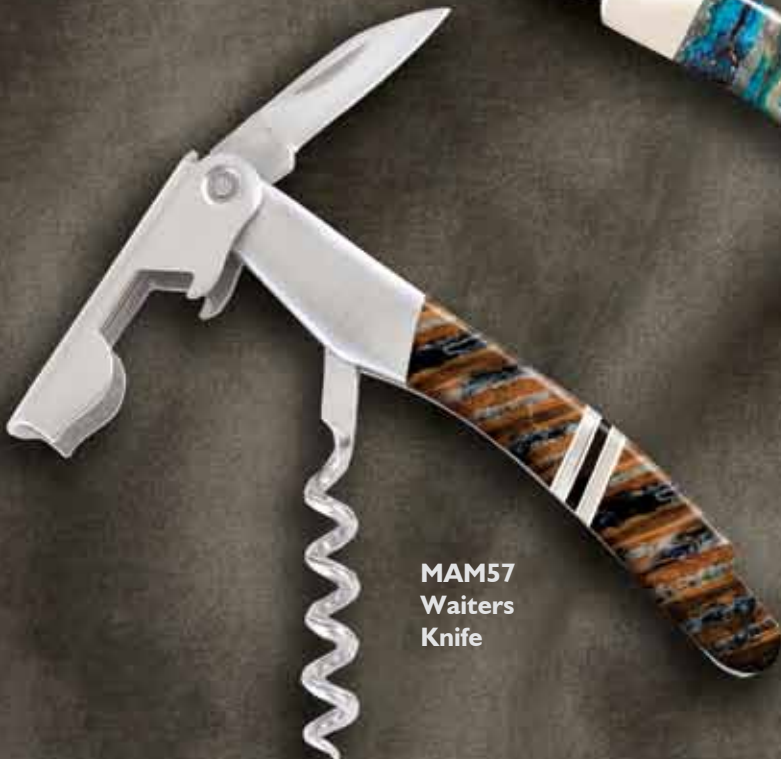
MAM57 Waiters Knife

Of all the animals that lived during the last Ice Age, the Woolly Mammoth is one of the best known.