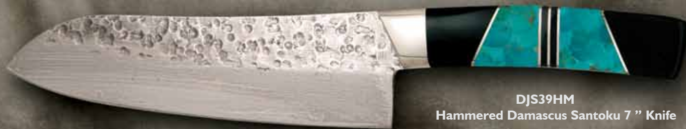
DJS39HM Hammered Damascus Santoku 7" Knife