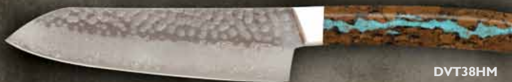
DVT38HM Hammered Damascus Santoku 5" Knife