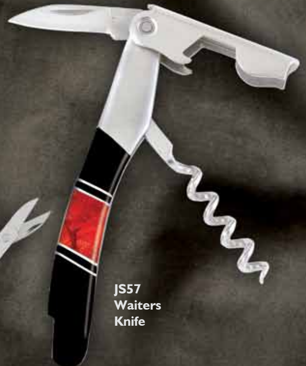
JS57 Waiters Knife