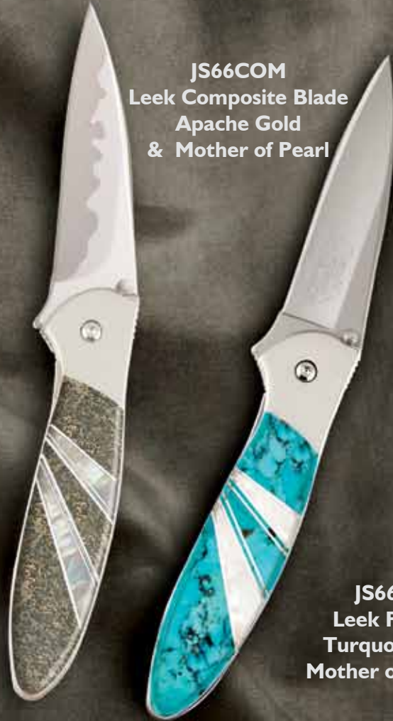
JS66COM Leek Composite Blade Apache Gold & Mother of Pearl