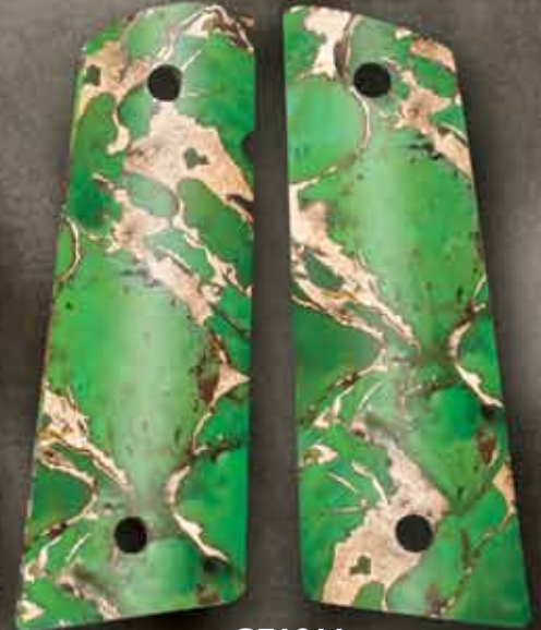
GE1911 Green Turquoise - Bronze

Bison Leather 3" Knife Pouches Available in either Brown or Black Bison Hide and with or without clip.