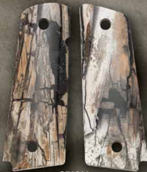
GE1911 Mammoth Tusk