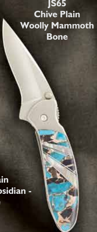
JS65 Chive Plain Woolly Mammoth Bone