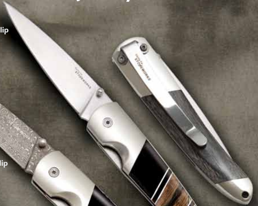
DJS70MI 4" Damascus Linerlock w/ clip