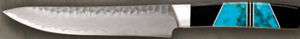
DJS90HM Hammered Damascus Steak Knife 5" blade