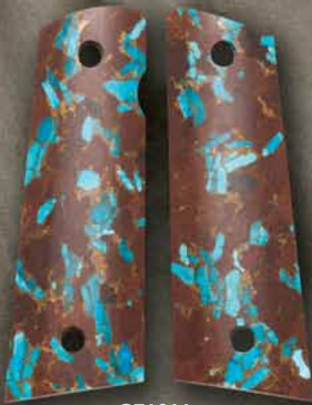
GE1911 Turquoise - Obsidian - Bronze