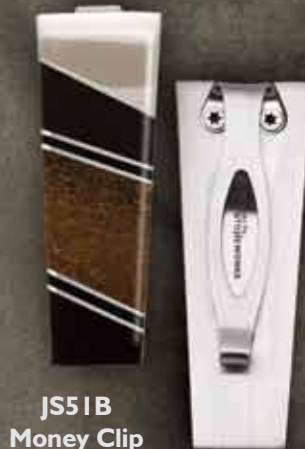
JS51B Money Clip