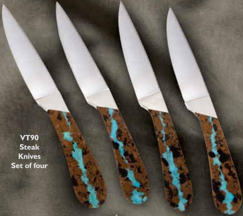
VT90 Steak Knives Set of four