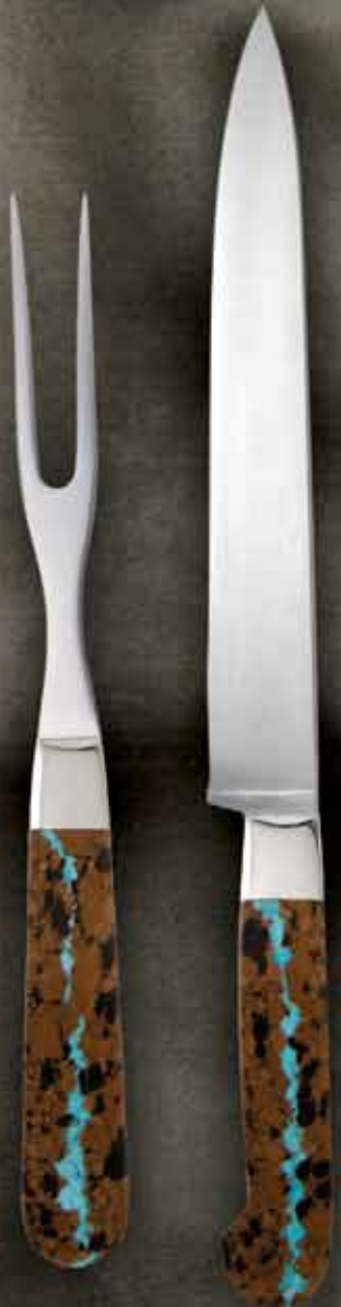
VT95 Carving Set