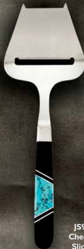
JS98 Cheese Slicer