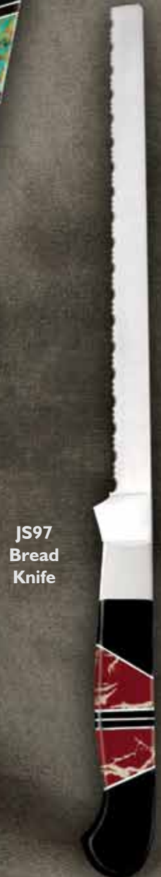
JS97 Bread Knife