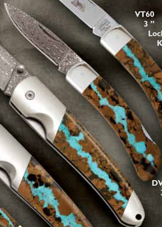
DVT60 3" Damascus Steel Lockback Knife