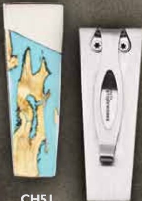
CH51 Money Clip Cholla / Aqua