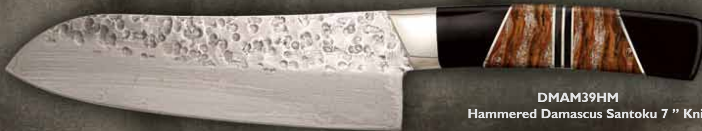
DMAM39HM Hammered Damascus Santoku 7" Knife