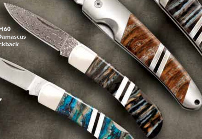
DMAM60 3" Damascus Lockback