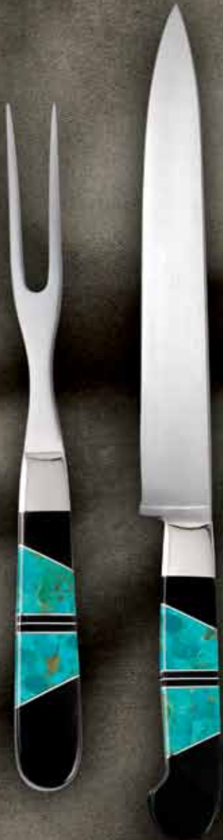
JS95 Carving Set