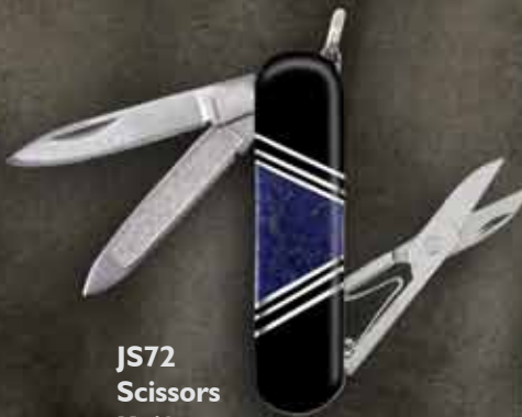
JS72 Scissors Knife