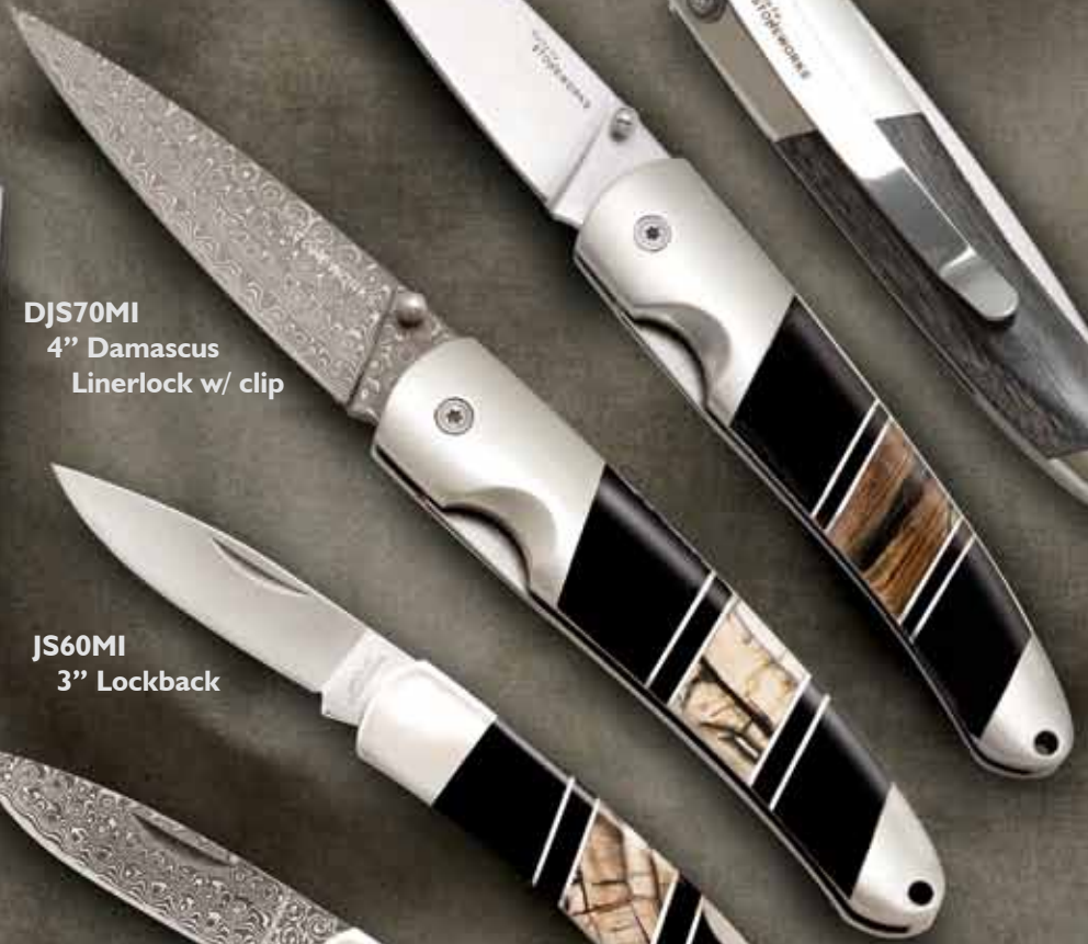
DJS70MI 4" Damascus Linerlock w/ clip