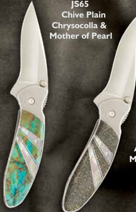
JS65 Chive Plain Chrysocolla & Mother of Pearl