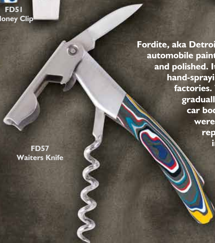
FD57 Waiters Knife

Fordite, aka Detroit Agate or Motor Agate, is pre-1985 automobile paint which has hardened sufficiently to be cut and polished. It was formed by the now extinct practice of hand-spraying multiples of car bodies in automobile factories. The overspray paint in the painting bays gradually built up on the tracks and skids that the car bodies moved on. Over time many colorful layers were built up. These layers were hardened repeatedly in the ovens that the car bodes went into to cure the paint. Some of these layers were baked over 100 times! Eventually the paint build-up would have to be removed and some auto workers, entranced by the beauty of this material took home chunks in their lunch buckets. We are proud to offer this very historic and unique material on our pocket and table cutlery.