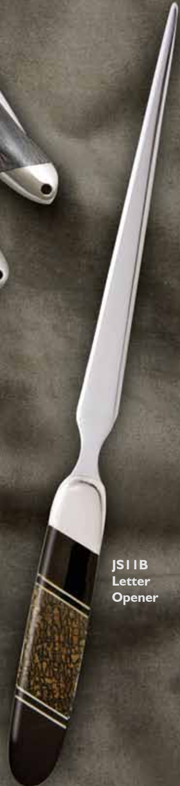
JS11B Letter Opener