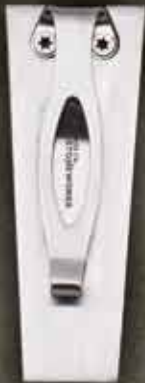
MAM70 4" Linerlock w/ clip