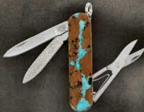
VT72 Scissors Knife