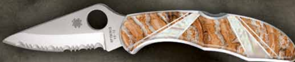
SPYJ11 Delica Mammoth Tooth / Mother of Pearl Sweeps