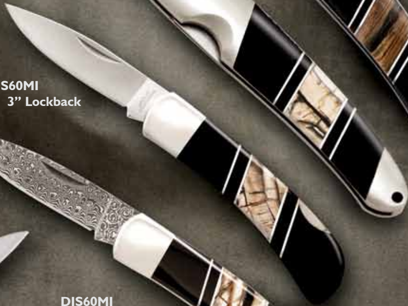
DJS60MI 3" Damascus Lockback