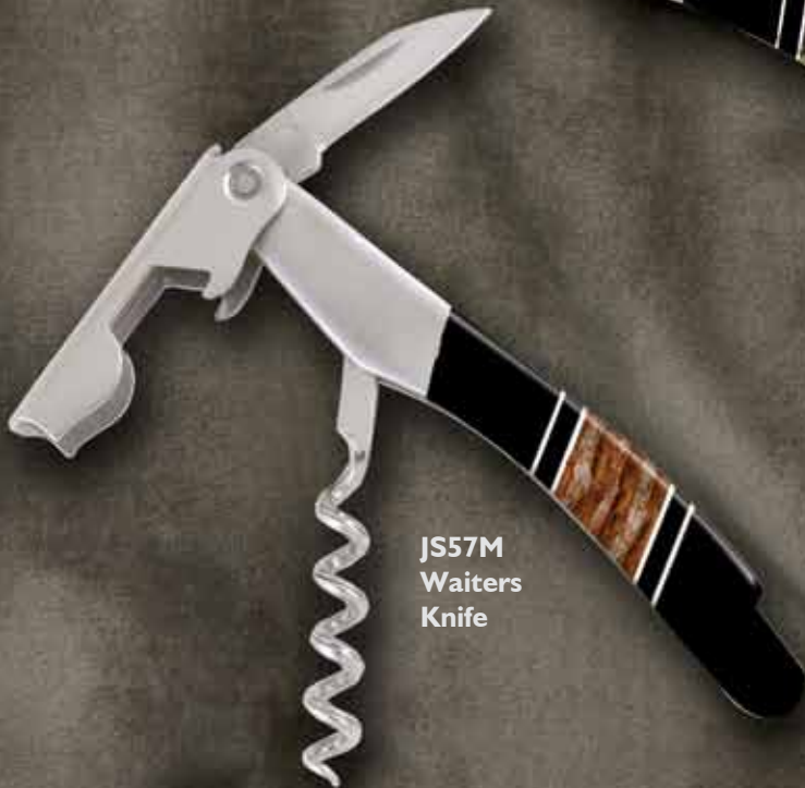
JS57M Waiters Knife