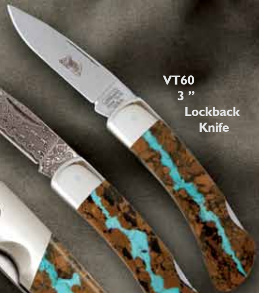
VT60 3" Lockback Knife