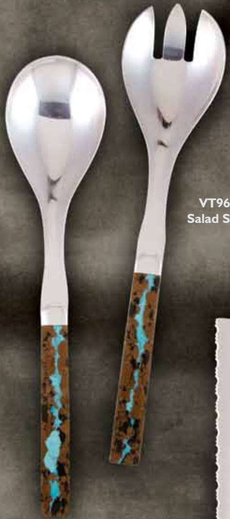
VT96 Salad Set