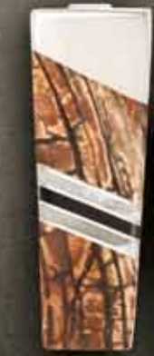
MI51 Money Clip