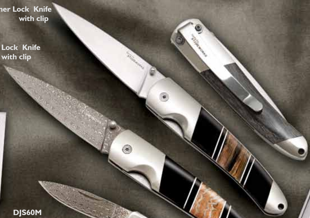
DJS60M 3" Damascus Lockback