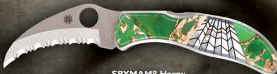
SPYMAM8 Harpy Green Turquoise • Bronze / Mother of Pearl Web