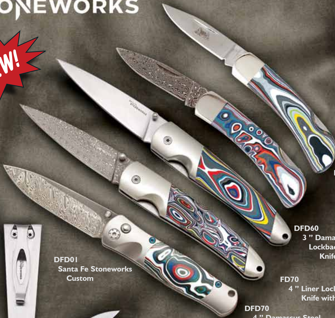
FD60 3" Lockback Knife