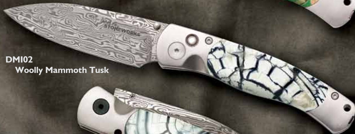
DMI02 Woolly Mammoth Tusk