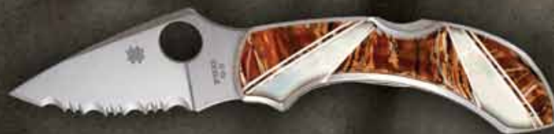
SPYMI28 Mammoth Tusk / Mother of Pearl Sweeps