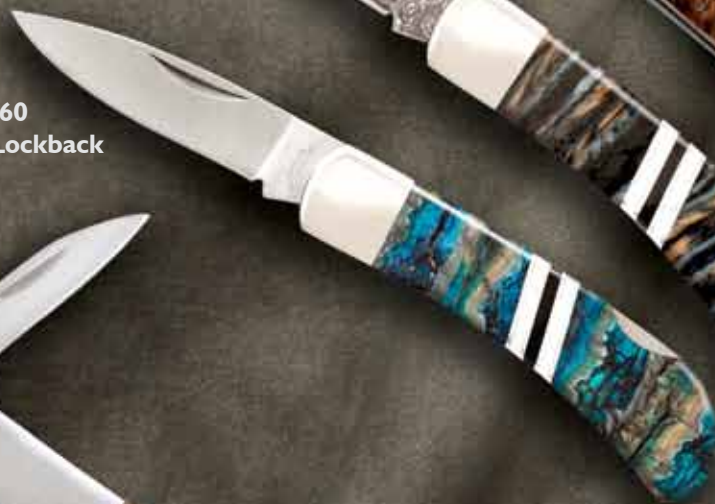
MAM60 3" Lockback