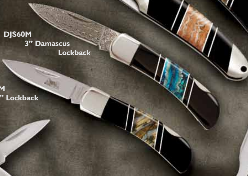
JS60M 3" Lockback