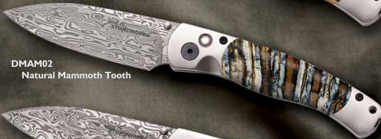
DMAM02 Natural Mammoth Tooth