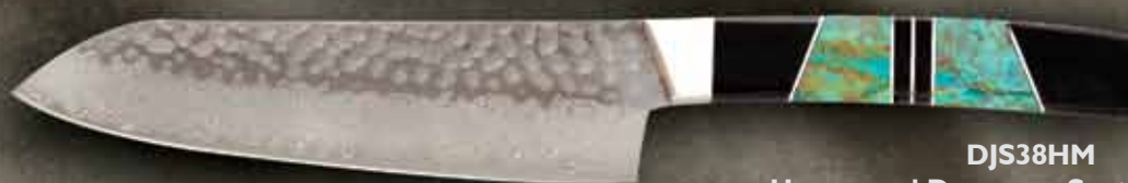
DJS38HM Hammered Damascus Santoku 5" Knife