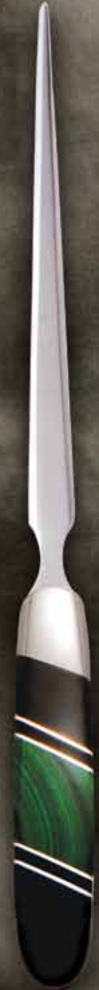
JS11 Letter Opener

We accent them with Mother-of-Pearl & Coral from the Phillipines and Jet or Black Amber from the Southwest. Functional, beautiful and of the highest quality craftsmanship.