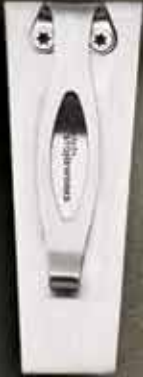
MI70 4" Linerlock w/ clip