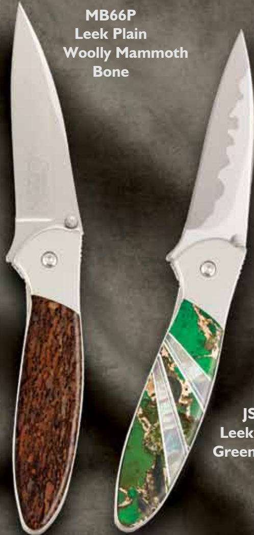
JS66COM Leek Composite Green Turquoise - Bronze