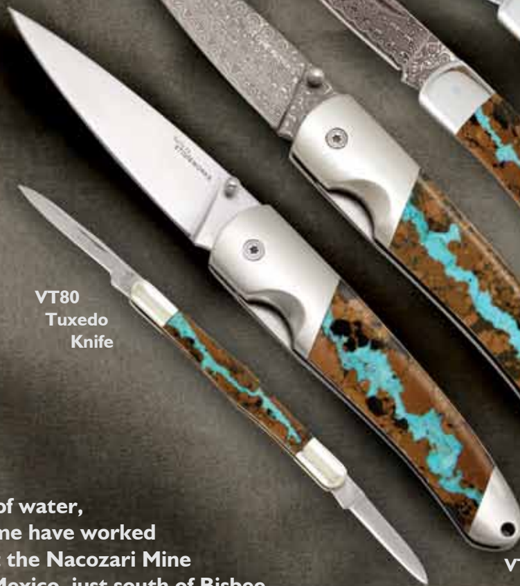
VT80 Tuxedo Knife