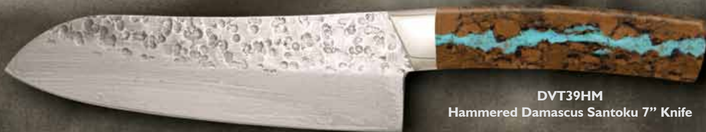
DVT39HM Hammered Damascus Santoku 7" Knife