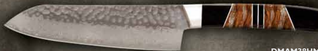
DMAM38HM Hammered Damascus Santoku 5" Knife