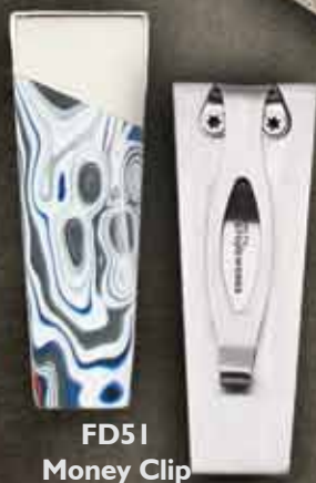
FD51 Money Clip