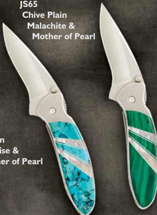
JS65 Chive Plain Malachite & Mother of Pearl