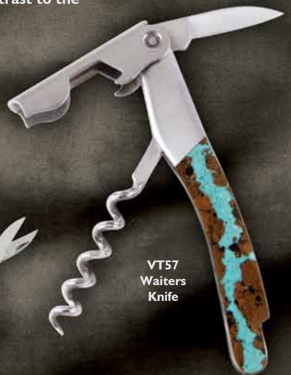
VT57 Waiters Knife

Our Vein Turquoise is a unique new presentation for Santa Fe Stoneworks pocket knives & table cutlery. We hope you enjoy our Vein Turquoise now, and as a future heirloom to be appreciated for years to come.