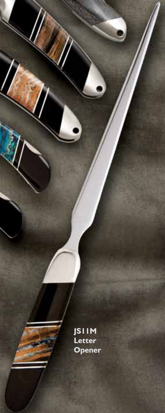
JS11M Letter Opener