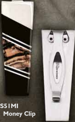
JS51MI Money Clip