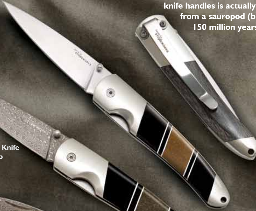
JS70B 4" Liner Lock Knife with clip