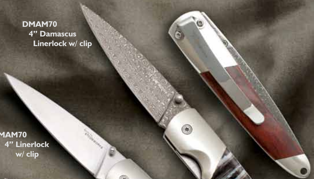
DMAM70 4" Damascus Linerlock w/ clip