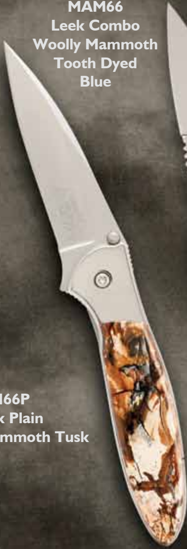
MAM66 Leek Combo Woolly Mammoth Tooth Dyed Blue