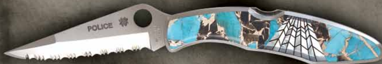
SPYJ7 Police Model Turquoise - Obsidian / Mother of Pearl Web