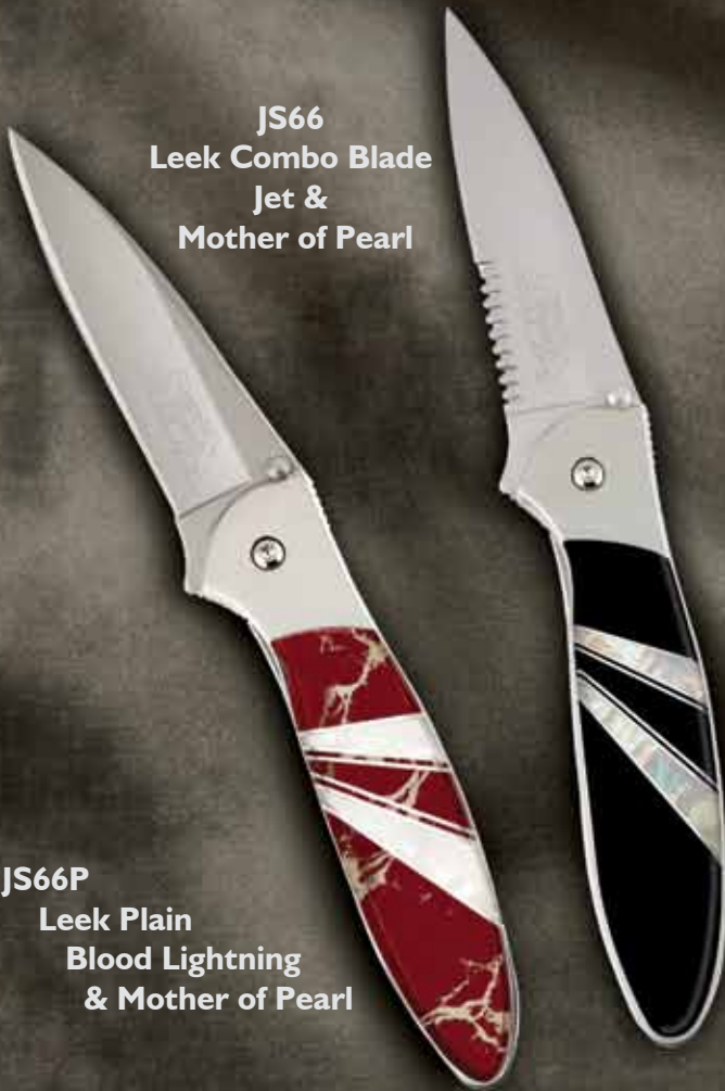
JS66 Leek Combo Blade Jet & Mother of Pearl