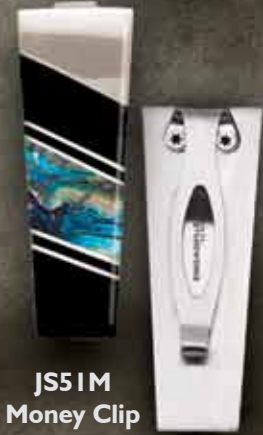
JS51M Money Clip